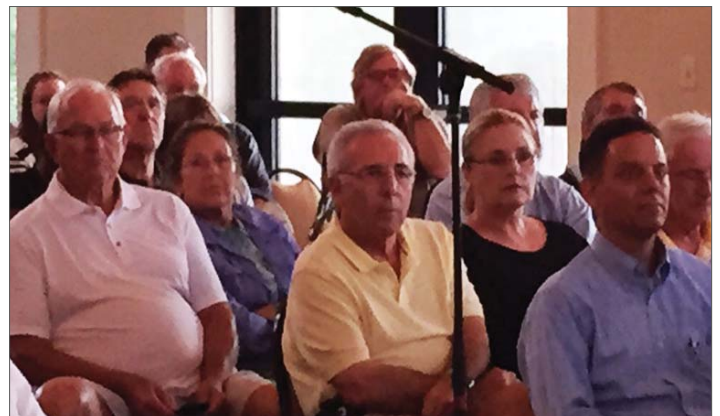
A large crowd gathered at the Cooper River Room at Mount Pleasant Waterfront Park as ULI South Carolina delivered their assessment of the proposed Framework for Growth Management