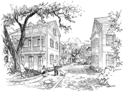
Artist rendering of Earl's Court