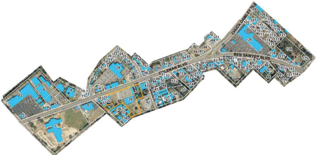
Coleman Boulevard Urban Corridor Overlay District

There are differences in opinion on how the town should move forward with the Coleman Overlay - those who want to abandon it all together, those who want to reexamine impact on surrounding neighborhoods, design elements and density; and those who feel that abandoning the plan now will only lead to increased housing costs and other unintended consequences.