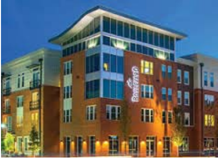
The Boulevard Apartment complex