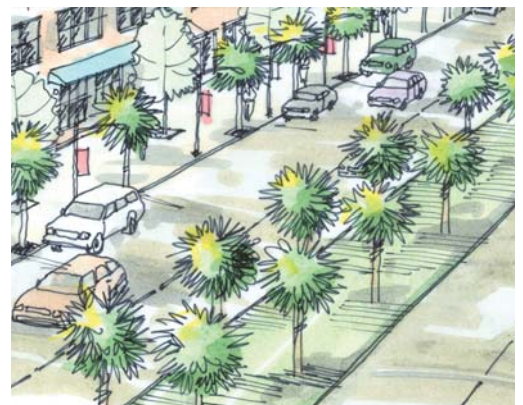
Rendering of Coleman Blvd. for Revitalization Master Plan for Coleman and Ben Sawyer (2008)