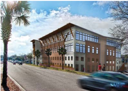
Conceptual design of office building at Coleman Blvd & Mill Street